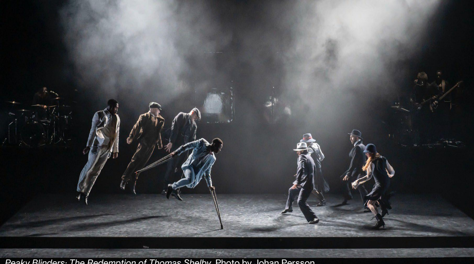
Peaky Blinders: The Redemption of Thomas Shelby.