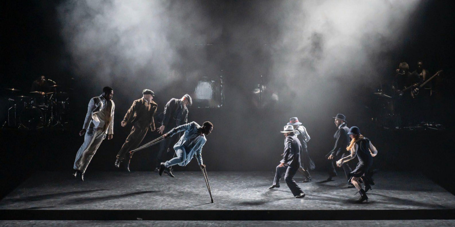
Peaky Blinders: The Redemption of Thomas Shelby.