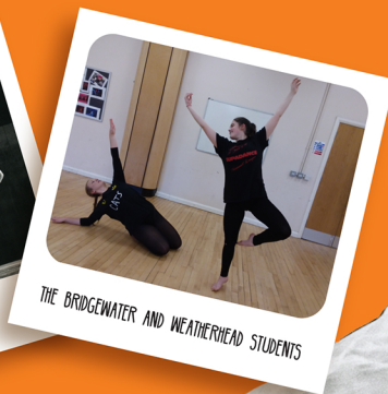
THE BRIDGEWATER AND WEATHERHEAD STUDENTS