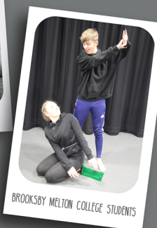
BROOKSBY MELTON COLLEGE STUDENTS

3 HUSBAND EVENTUALLY DECIDES TO GRANT FOX HER FREEDOM